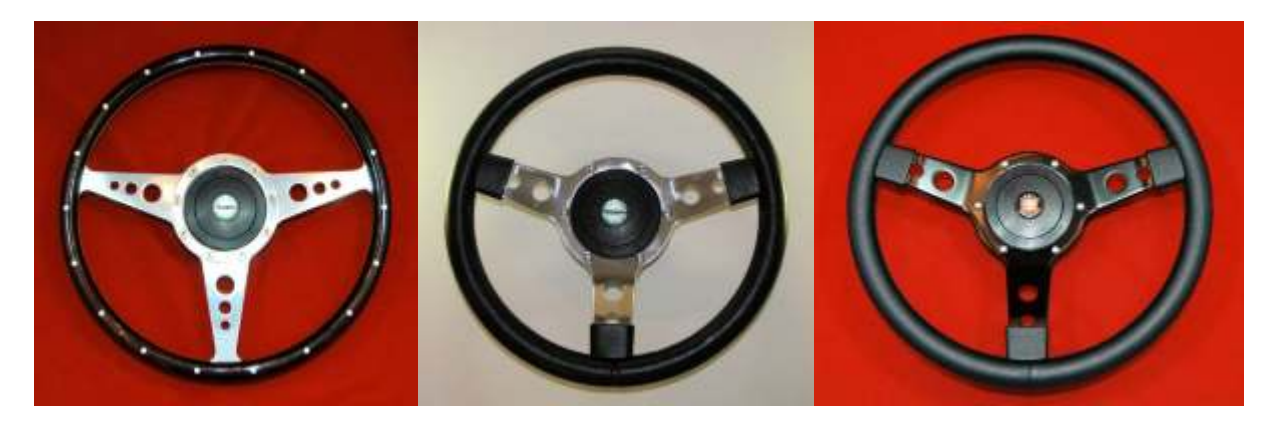
Wood, Leather and Vinyl Steering Wheels for Classic Cars At Exceptional Prices