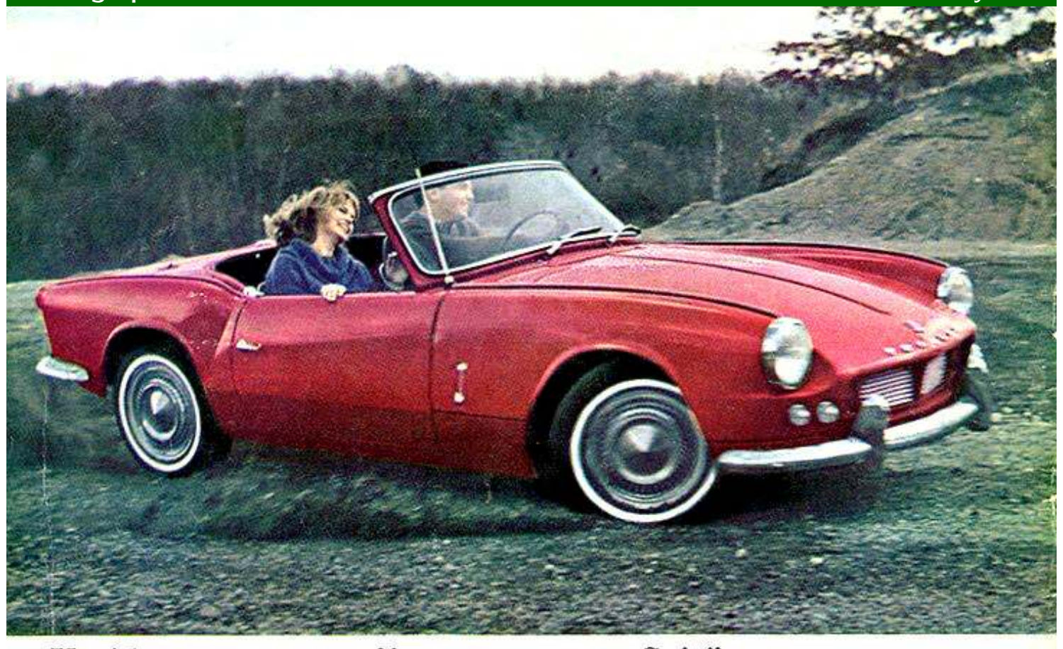
You'd act sassy, too ... if your name was Spitfire.

You can't blame a Spitfire for feeling exuberant. It simply outclasses everything in its price league.